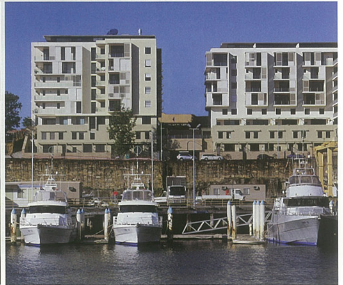
LEFT, RIGHT + TOP: POINT APARTMENTS.

apartments are painted a variety of white hues.