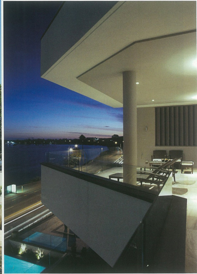
LEFT AND ABOVE: SC LAND APARTMENTS, OVERLOOKING THE SWAN RIVER IN PERTH.

principle rooms, including the living areas and main bedroom, enjoy the river outlook. The vista can also be appreciated from generous 50 square metre balconies. "We didn't want the balconies to overpower the building or the river," says Chu, who modulated the balconies, made of glass and solid masonry. "We wanted to create depth to the building, as well as creating a rhythm