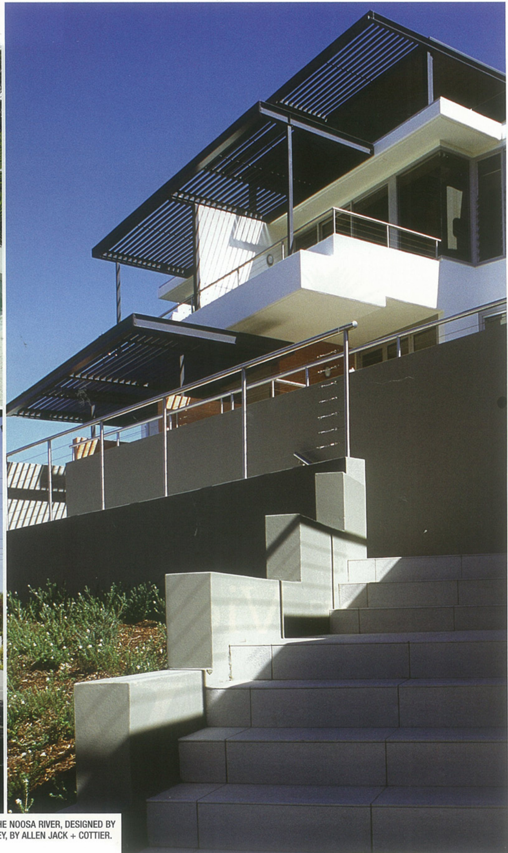
ABOVE + TOP: THREE-STOREY APARTMENT BUILDING OVERLOOKING THE NOOSA RIVER, DESIGNED BY BARK DESIGN. RIGHT: POINT APARTMENTS, AT PYRMONT POINT, SYDNEY, BY ALLEN JACK + COTTIER.

timber and natural materials, the Noosaville apartments are concrete and steel. "The developers didn't want a weathered timber look. They didn't want something that required upkeep," says Guthrie. Louvred glass windows allow the breeze to circulate and steel louvers in